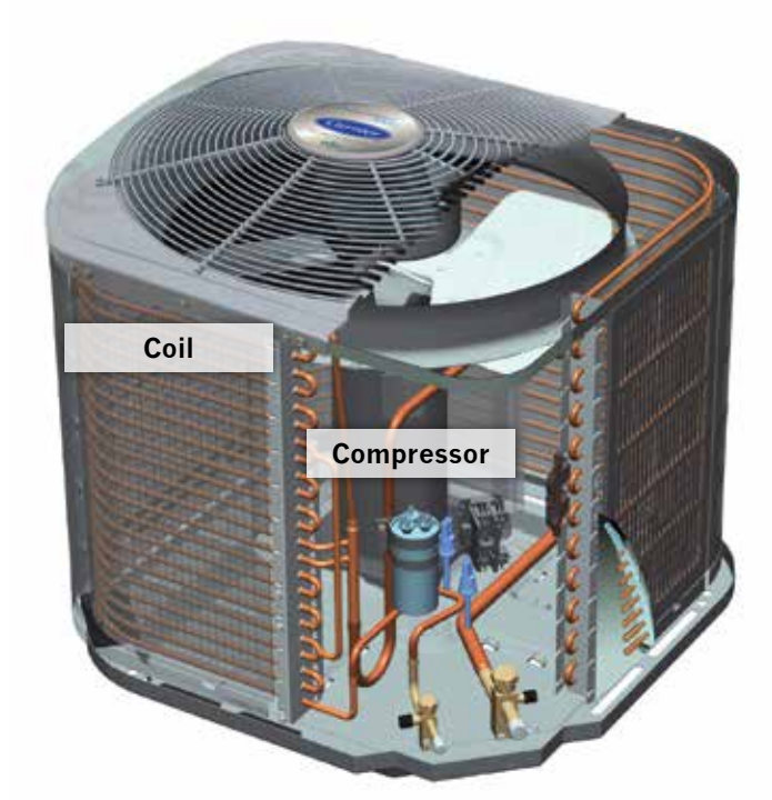
Performance™ 17 Air Conditioner Shown