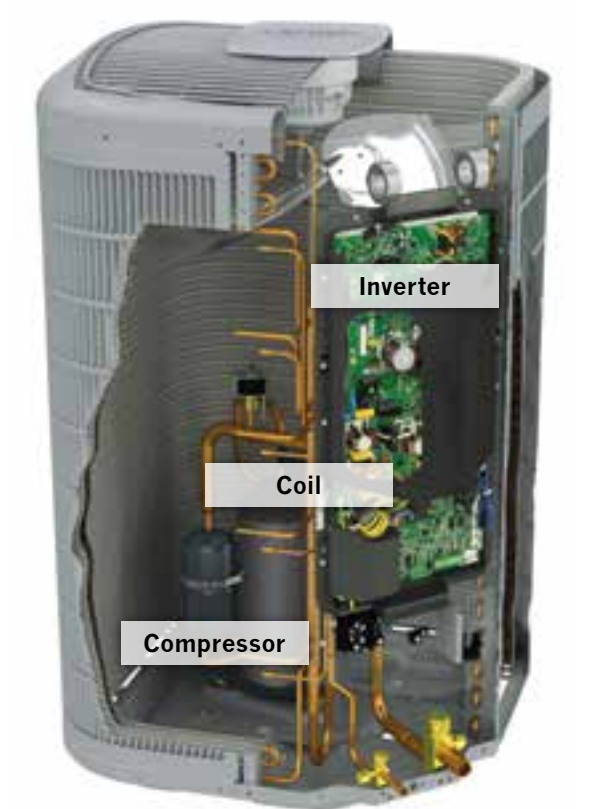
Infinity® 19VS Air Conditioner Shown