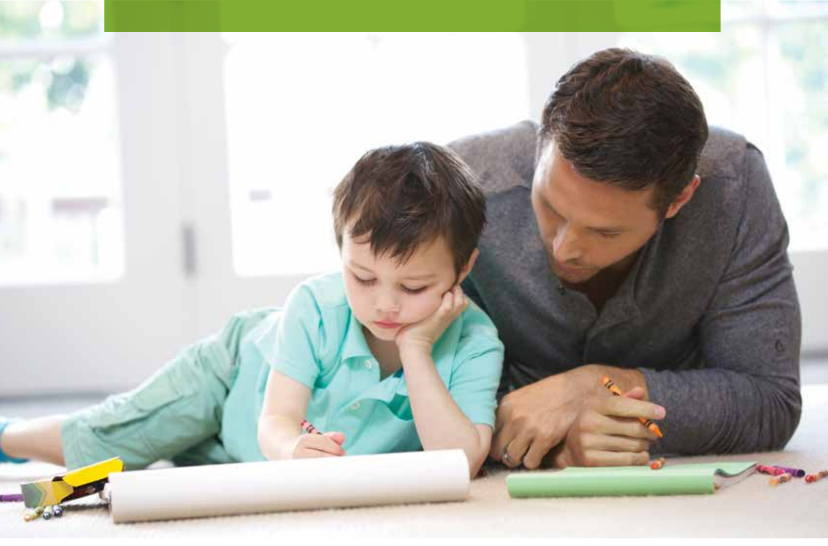
Proven, reliable comfort, up to 16.5 SEER rating