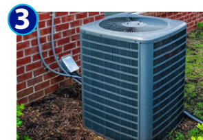
Around the existing unit and/or new space

Remove valuables (pictures, artwork, knickknacks, antiques) from walls, stairwells, nearby tables and bookshelves.